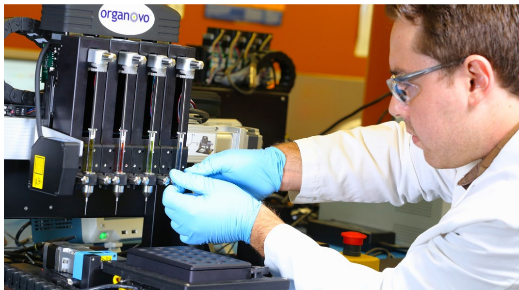
A scientist at Organovo preps one of the company's proprietary bioprinters.

Organovo's 3D bioprinting technology coupled with Corning's Transwell® permeable supports takes 3D cell culture research to a new level.